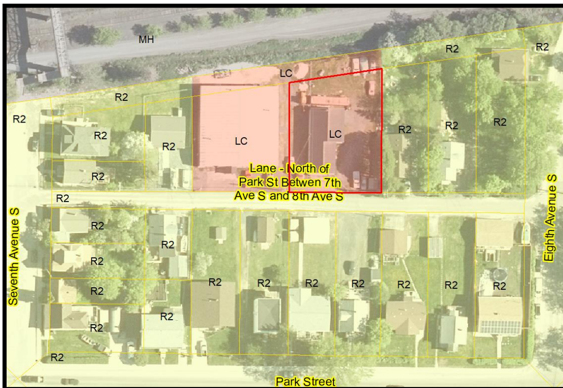
Figure 4 –Zoning By-law Mapping

The proposed kennel is a shelter kennel and is proposed to be used exclusively for cats.