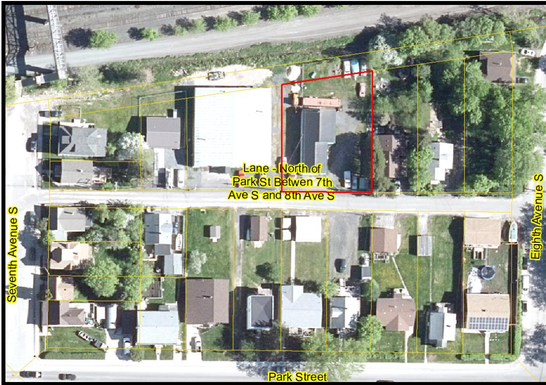
Figure 1: Aerial image indicating the location of the subject property (2022).