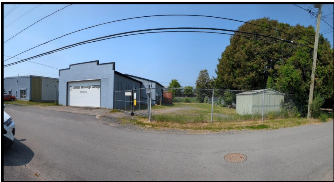
Figure 2 – Panoramic photo of the property from the laneway between Seventh Avenue South and Eighth Avenue South. The proposed location of the cat shelter is in the building located to the left of the center of the photo.

On June 16 th , 2023, the Associate Planner conducted a site visit and took the following photo.