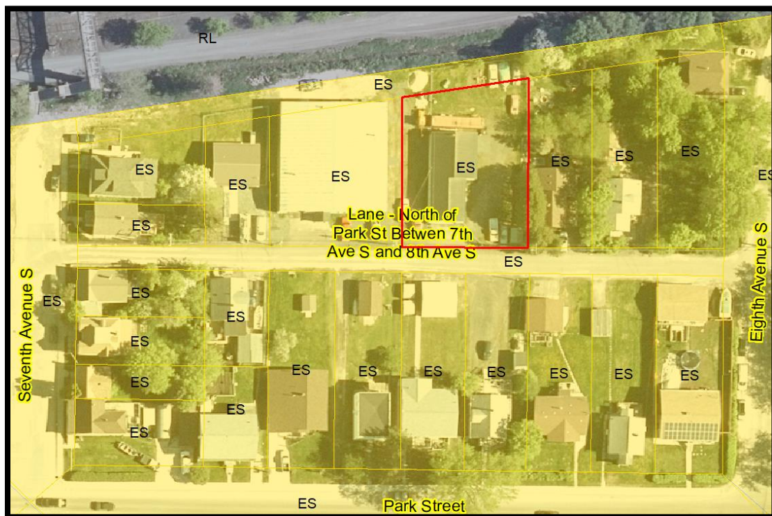
Figure 3 – Official Plan Mapping

In the Established Area, minor changes to land use that are compatible with existing land uses, do not result in significant increases to traffic, dust, odour or noise, are similar in scale to the surrounding built form and that improve the quality of life for area residents may be permitted through an amendment to the Zoning By-law (Policy 4.1.2(e)).